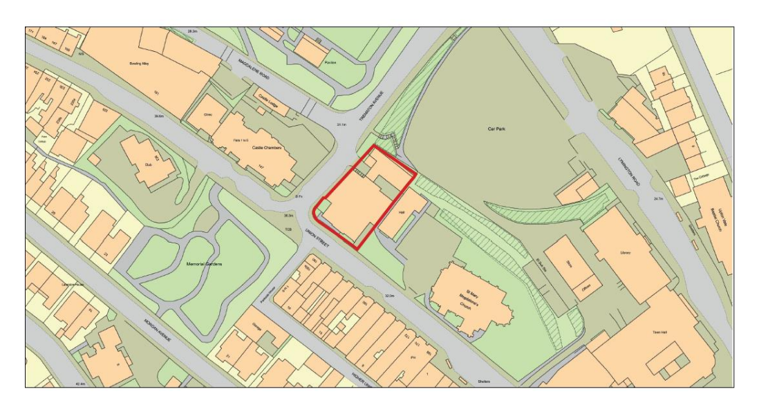
Old Magistrates Court Location Plan 1-1250 - Location Plan